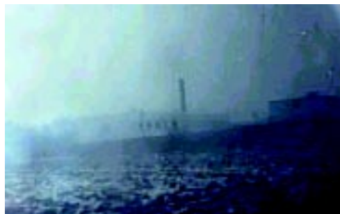
Tower building of the Masanjia Labor Camp

· Shen Roulin was punished by “Arching” for persisting