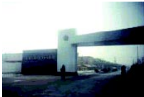
Front gate of the Masanjia Labor Camp

Apart from brutal torture, they imposed extra-heavy workloads on practitioners, often forcing them to work fifteen or sixteen hours well past their point of exhaustion. Af-