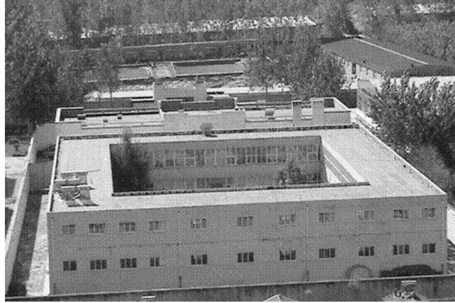
FIGURE 1. LANGFANG BRAINWASHING CENTER IN HEBEI PROVINCE